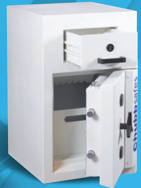
Grade 2 Size 3 with Front Facing Drawer Trap