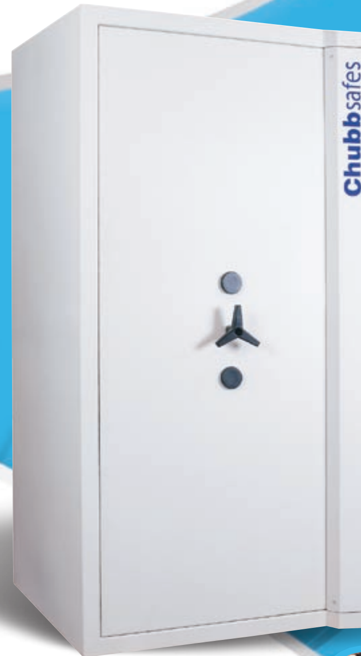
Grade 5 Size 7

Chubb safes products are delivered and installed by trained Chubb safes installers. Whatever the delivery environment (e.g. large bank or small office) you can be assured that the installers will take the greatest care. We are also focused on making sure the service on offer is achievable, to the highest standards of workmanship and is promptly completed within the contracted timescales.